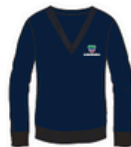
V-Neck Sweater Boys & Girls Optional AED 146-169