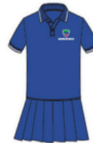
Dress Girls FS1-2 AED 149