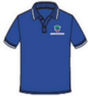
Polo T-Shirt Boys Year 1-6 AED 111-130