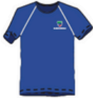
P.E. T-Shirt Boys & Girls Compulsory AED 107-135