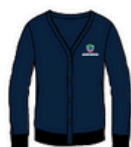
Navy Blue Cardigan Boys & Girls Optional AED 146-169