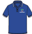
Polo T-Shirt Boys FS1-2 AED 111-130