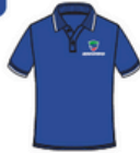
Polo T-Shirt Girls Year 1-6 AED 111-130