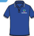
Polo T-Shirt Girls FS1-2 AED 111-130