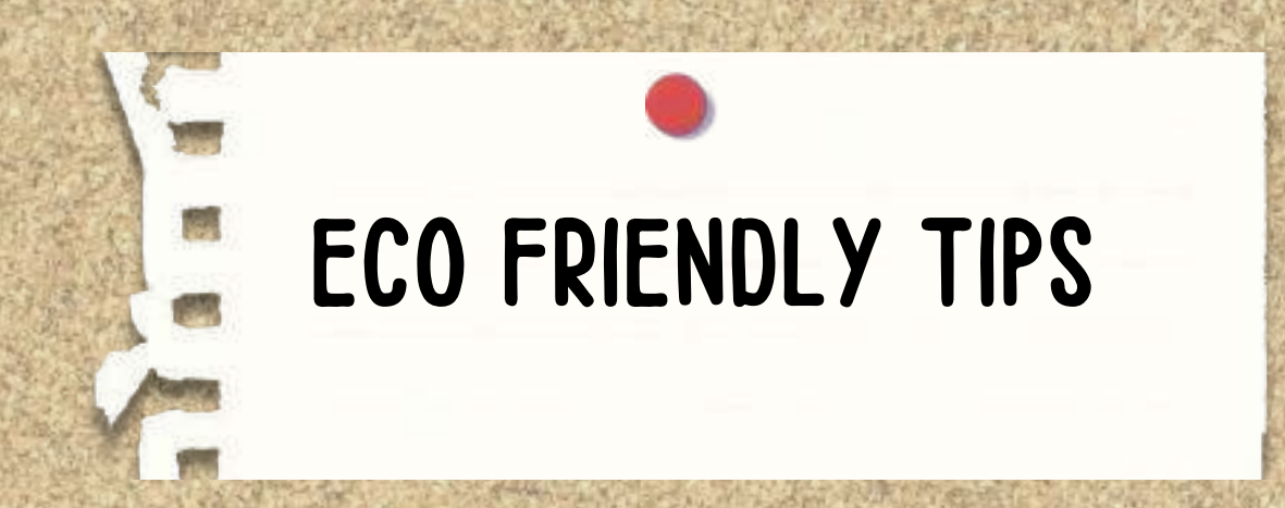
Eco Tip 1 SDG 12: Responsible Consumption and Production Use a reusable water bottle.